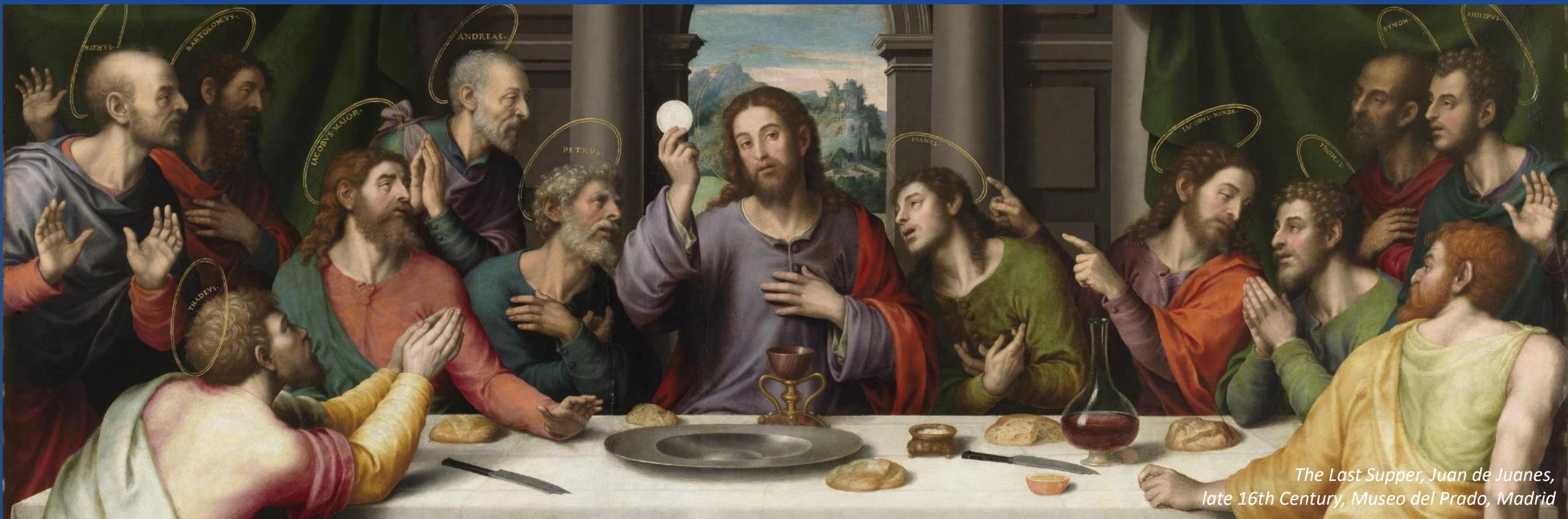
The Last Supper, Juan de Juanes, late 16th Century, Museo del Prado, Madrid

And he took bread, and when he had given thanks, he broke it and gave it to them, saying, 'This is my body, which is given for you. Do this in remembrance of me.'