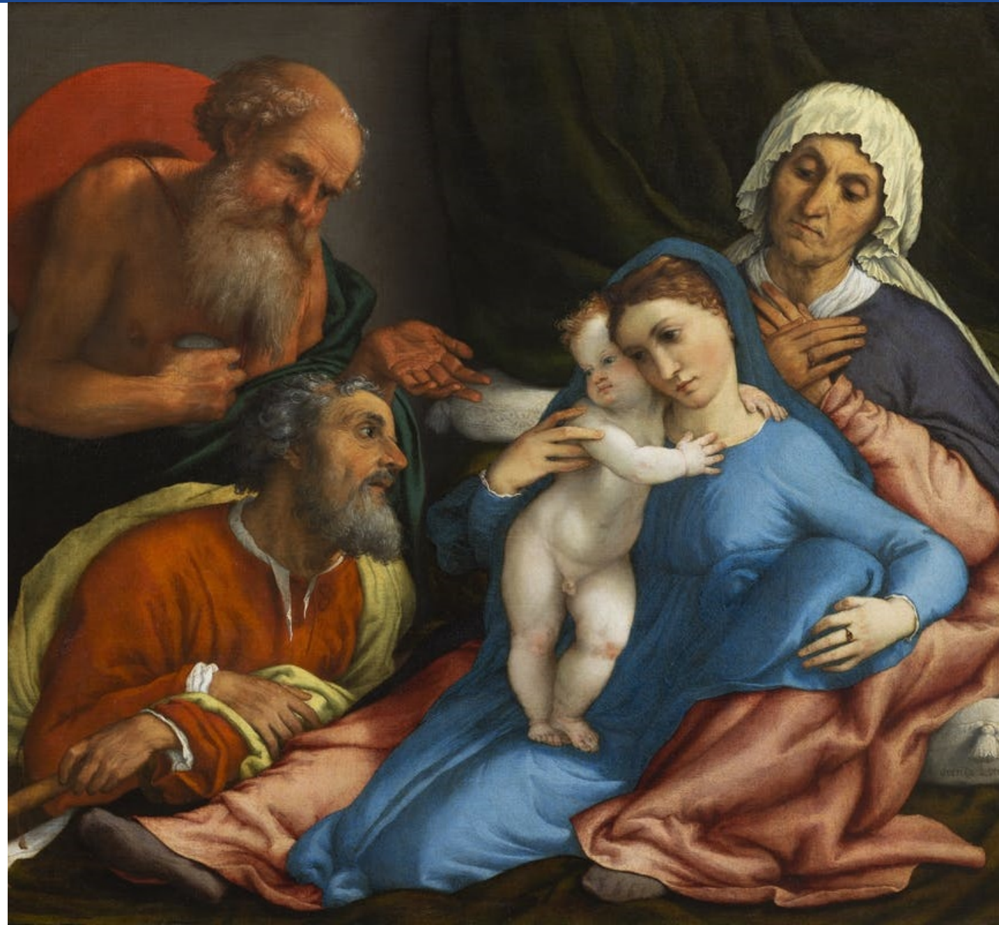
Holy Family with St Jerome, Lorenzo Lotto 1534 The Uffizi, Florence, Italy