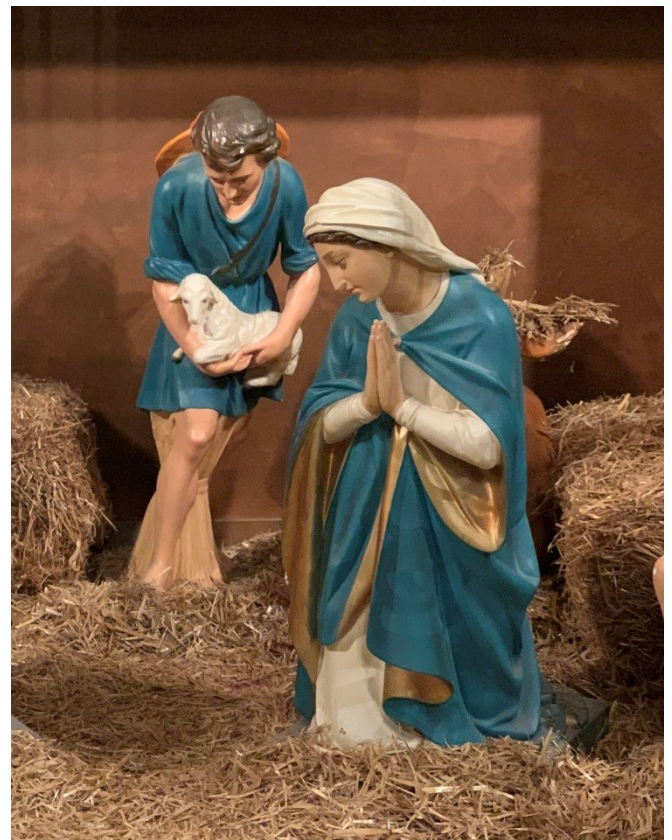
Crib scene, St George's Cathedral